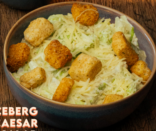
ICEBERG CAESAR SALAD